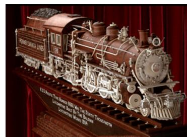
The world's most fascinating carvings at Warther's Museum in Dover

If rail related tours become a part of your offerings, we encourage you to become an ORTA member as well and benefit from the synergies of our shared efforts to promote rail tourism. Membership is open to tourist railroads, excursion operators, depots, railroad historical groups, rail museums, attractions that involve rail displays, rail festivals, any business involved in tourist rail activities (i.e., restaurants, suppliers), and individual supporters.