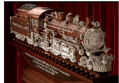
The world's most fascinating carvings at Warther's Museum in Dover

If rail related tours become a part of your offerings, we encourage you to become an ORTA member as well and benefit from the synergies of our shared efforts to promote rail tourism. Membership is open to tourist railroads, excursion operators, depots, railroad historical groups, rail museums, attractions that involve rail displays, rail festivals, any business involved in tourist rail activities (i.e., restaurants, suppliers), and individual supporters.